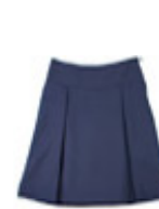
1298 Navy, Khaki